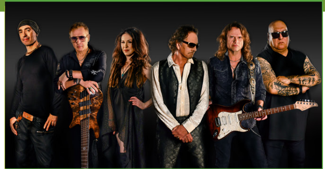
STARSHIP feat. MICKEY THOMAS WILL HEADLINE THE MAIN STAGE AT THE 20TH ANNUAL SC PECAN AND MUSIC FESTIVAL IN DOWNTOWN FLORENCE, SC

The SC Pecan Music & Food Festival is guided and presented by a volunteer committee which assists in the development and implementation of the entire event. Planning takes place over a 10-month period each year and takes over 1,000 volunteer hours. The SC Pecan Music & Food Festival is a charitable program of the Florence Downtown Development Corporation, a 501(c)3 non-profit corporation.